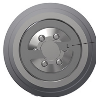
Figure 1 - Liquid or Vapor Stamp

"L" = Liquid (Red Stripe on Spring) "V" = Vapor (White Stripe on Spring)